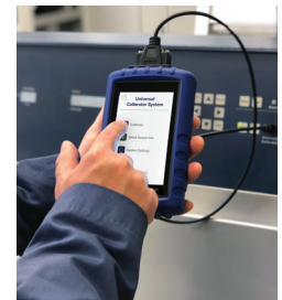
UC1 Handheld Display