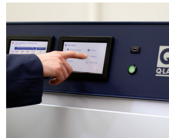
Onboard Displays (Gen 4)

Onboard touchscreen displays (Gen 4) or the UC1 Handheld Display (previous models) further simplify the calibration process through convenient drop-down menus to select tester, lamp, and optical filter configurations. Users can select one of eight languages (English, German, French, Spanish, Italian, Chinese, Korean, and Japanese) for calibration.