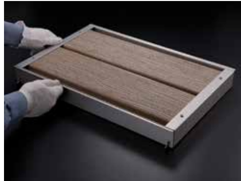
The Natural and Artificial Wood holder is used to expose materials typically used in decking and fencing applications.