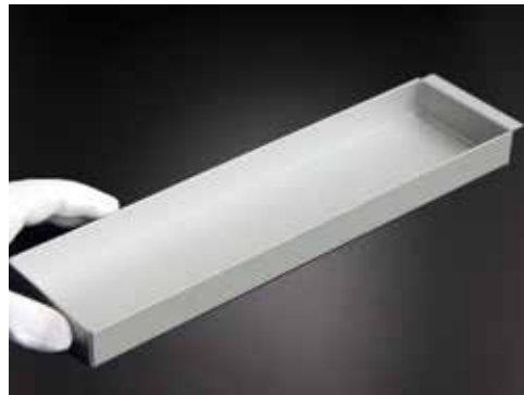
This small 3D part holder is provided without mounting hardware. Customers can use screws, zip ties, and wire or work with Q-Lab to design custom attachment hardware.