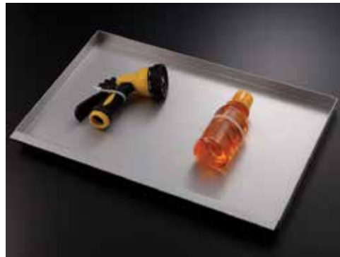
Three-dimensional specimens can be easily fastened to the large 3D part holder using zip ties, for example.