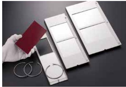
Panel holders are available in three sizes: standard, medium, and large.

Standard holders included with a new QUV tester. Medium or Large Flat Panel Holders may be substituted when ordering a new QUV tester.