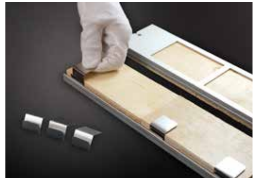
Thick panel retaining clips hold larger specimens in place on a flat specimen holder.

Each clip is designed to hold one specimen of approximately 6 to 19 mm ( \frac{1}{4} to \frac{3}{4} ") in a flat panel holder.