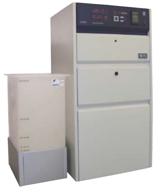
The Q-Sun Xe-3-HDS allows you to spray both water and an additional solution onto test specimens.

220-liter Reservoir. Holds a sufficient amount of a secondary solution for ease of operation. The reservoir cart is on casters for easy mobility and maintenance.