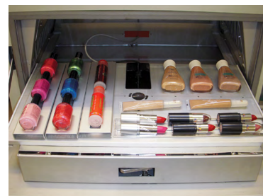
Bottles and other oddly-shaped samples can be easily tested in a Q-SUN chamber due to its flat specimen tray and variety of mounting options.

Although chamber relative humidity may not be critical for testing drug substances enclosed in packaging or test bottles, the Q-SUN Xe-3 provides precise control of RH for testing materials exposed to indoor or outdoor environments that may benefit from RH control.