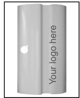
Panels can be customized in dozens of different ways, such as adding your company's logo.