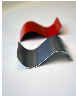
Custom panels in complex shapes can be created with a small minimum order size.