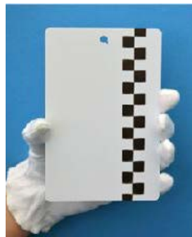
A variety of different pre-painted, patterned and other custom panels can be made upon request.