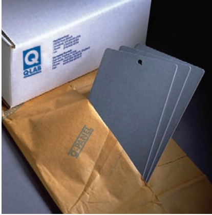
Panels are stored completely clean and, in most cases, can be used right out of the box.

Steel panels are packed in plastics bags in quantities of 20 to 50 panels, depending on type and thickness. Each packet contains vapor phase rust inhibitor. Between 4 and 10 packets are placed in a sturdy cardboard carton. With this multi-layer packaging, our steel panels have a shelf life of up to 10 years. The panels are stored completely clean, so there is no chance of oil stain ruining the surface. Aluminum panels are packed similarly, except without rust inhibitor.