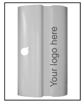
Panels can be customized in dozens of different ways, such as adding your company's logo.