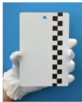
A variety of different pre-painted, patterned and other custom panels can be made upon request.