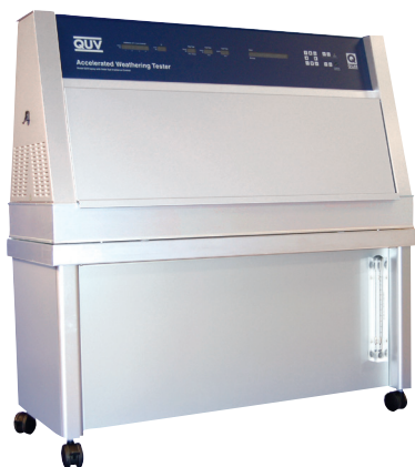
Figure 1 - Fluorescent ultraviolet-condensation apparatus