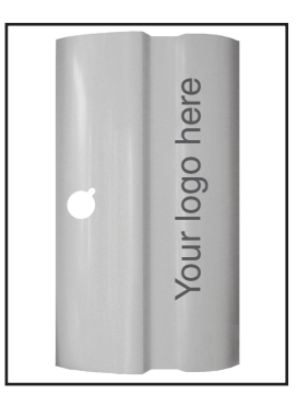
Panels can be customized in dozens of different ways, such as adding your company's logo.