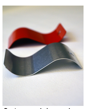
Custom panels in complex shapes can be created with a small minimum order size.