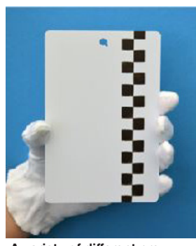
A variety of different prepainted, patterned and other custom panels can be made upon request.