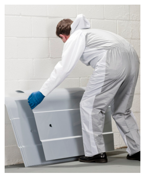
The Q-PANEL automotive refinish training system is a costeffective simulation of hoods and fenders.

These custom panels are most cost-effective when there are quantities sufficient to allow an economical production run, and when the material is available from our stock metal or readily available alloys. Contact Q-Lab with your custom panel specifications now!