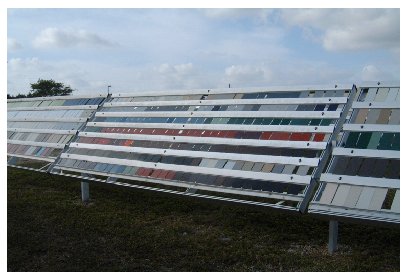
Florida exposure rack at 45 degrees South

Exposures in Miami are not only realistic, they are accelerated. One or two years of Florida sunshine can equate to several years of weathering elsewhere. There is no set rate for this acceleration as there are many variables that will affect the outcome, but it is generally accepted that Florida testing accurately predicts what happens in temperate regions.