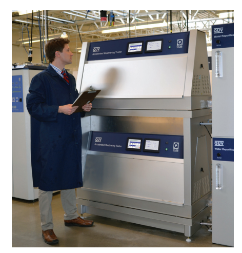
Stacking testers on the space saver frame allows easy access to both machines.