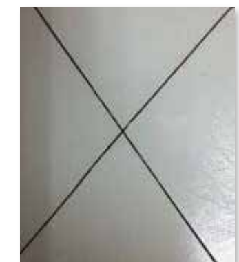
Paint applied to aluminum with pre-treatment B shows excellent adhesion performance