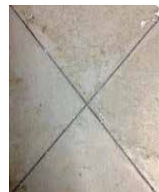
Paint applied to bare aluminum surface has completely delaminated

In short, the presence or type of pre-treatment can have a dramatic effect on paint adhesion performance.