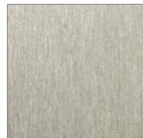
CHROMATED FINISH (AL, AT)