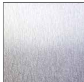
MILL FINISH (A)

Type AT panels are the same as Type AL, but instead treated with an environmentally-friendly trivalent chromium pretreatment that may offer less adhesion than Type AL.