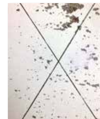
Paint applied to aluminum with pre-treatment A shows minimal adhesion failures