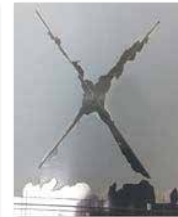
Aluminum panel made from alloy Y shows poor adhesion & significant delamination of paint from the surface