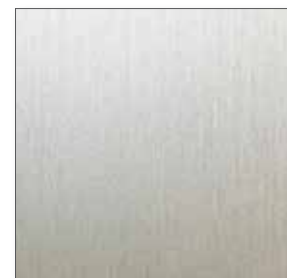
ANODIZED FINISH (AN)