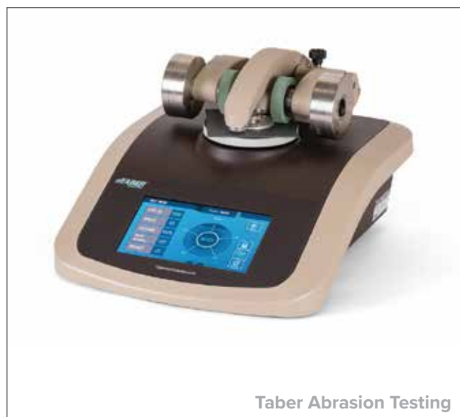
Taber Abrasion Testing

Type RS panels use heavy-gauge steel and are designed for lap shear testing of adhesives in a tensile tester.