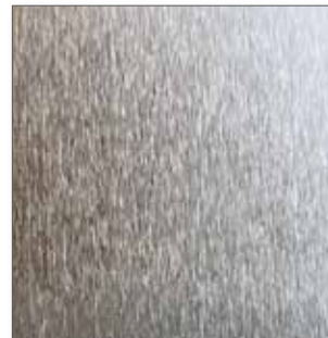
SMOOTH (D, QD)

Type S: same as Type R with one side ground for better adhesion results.