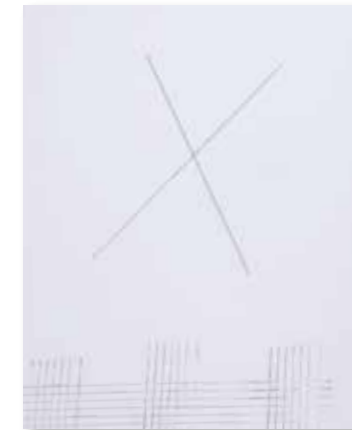
Aluminum panel made from alloy X shows excellent paint adhesion

The base metal is the only difference and demonstrates just how important the substrate itself is in paint adhesion performance.